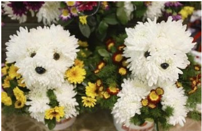
Flower Puppies – Hooray for Spring!

Thursday, April 21 – 7 p.m. Meeting and Program Program: Canines Against Cancer Details inside the Bits